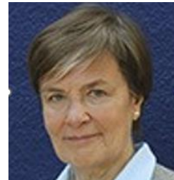
Astrid Thors European Parliament