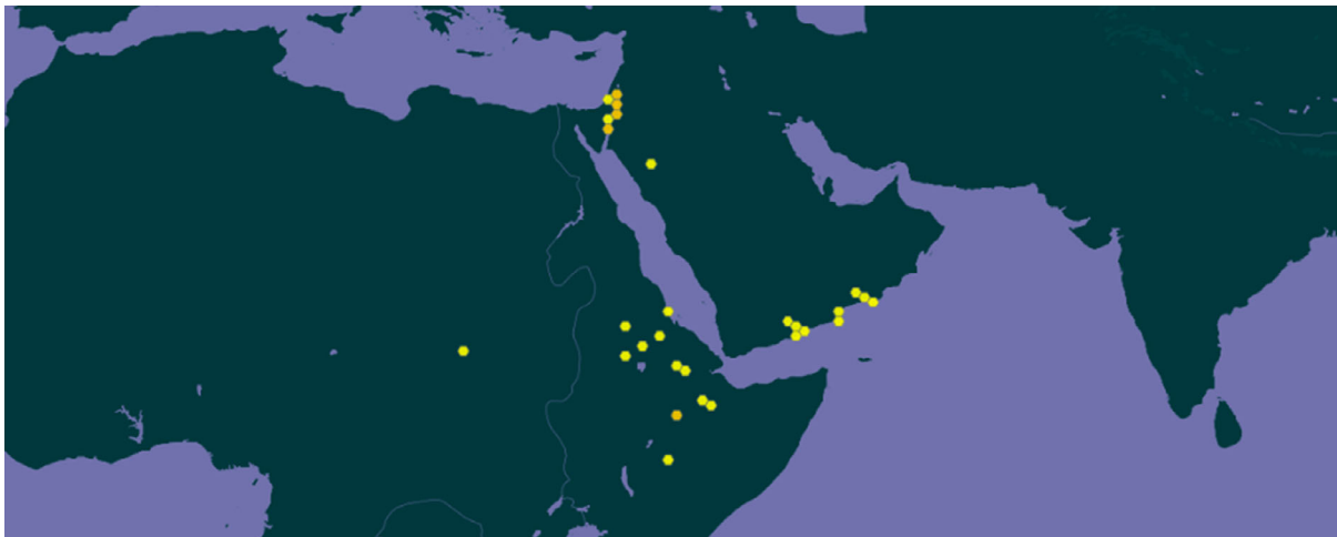
Figure 2: Georeferenced records of Plicosepalus acaciae in the GBIF database (GBIF Secretariat: GBIF Backbone Taxonomy. https://doi.org/10.15468/39omei Accessed via https://www.gbif.org/species/4001543 (6 December 2021))

The GBIF database has 181 records of P. acaciae (GBIF Secretariat, 2021a) which were considered reliable by the EFSA PLH Panel. The observations fall into the range reported in Plants of the World Online; however, most records (70%) are from Jordan and Israel (Figure 2), which is possibly related to higher recording efforts in these countries.