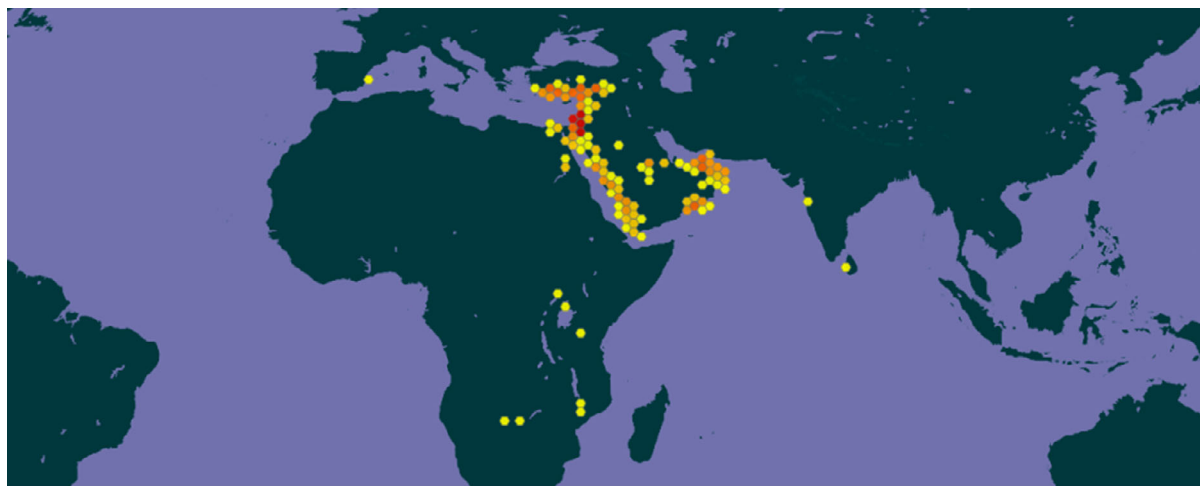
Figure 3: Distribution of Pycnonotus xanthopygos (GBIF Secretariat: GBIF Backbone Taxonomy. https://doi.org/10.15468/39omei Accessed via https://www.gbif.org/species/2486116 (6 December 2021))