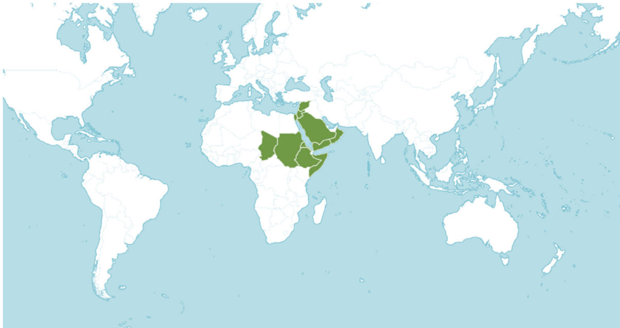
Figure 1: Global distribution of Plicosepalus acaciae

The GBIF database has 181 records of P. acaciae (GBIF Secretariat, 2021a) which were considered reliable by the EFSA PLH Panel. The observations fall into the range reported in Plants of the World Online; however, most records (70%) are from Jordan and Israel (Figure 2), which is possibly related to higher recording efforts in these countries.